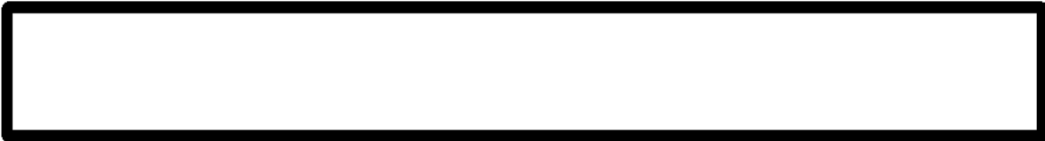
Table 2. Job Creation Estimates